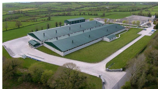
PIC's first elite farm in 1962 in Fyfield Wick, England (left), and the newest edition, Hermitage Genetics' flagship farm in Freneystown, Ireland (right).

PIC elite farm's main goal is to drive and effectively disseminate genetic improvement. Pigs with the highest genetic potential are produced in these farms and shipped around the globe.