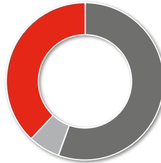
4 Terminal Lines